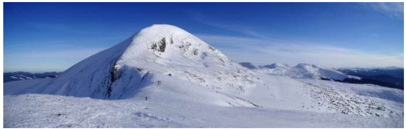
Hoverla peak 2061m

Day 5 Transfer to Zaroslyak 1350m (20km, 40m). Ski tour to Hoverla peak 2061m, the highest point of the region and Ukraine. Descent to Zarosliak, transfer to Tatariv.