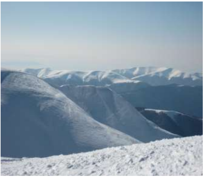
Bliznitsa peak 1881 m