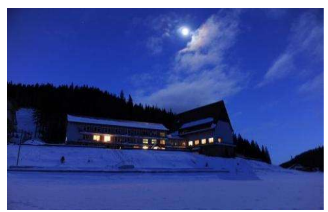
view from outside

Day 5 Transfer to Zaroslyak 1350m (20km, 40m). Ski tour to Hoverla peak 2061m, the highest point of the region and Ukraine. Descent to Zarosliak, transfer to Tatariv.