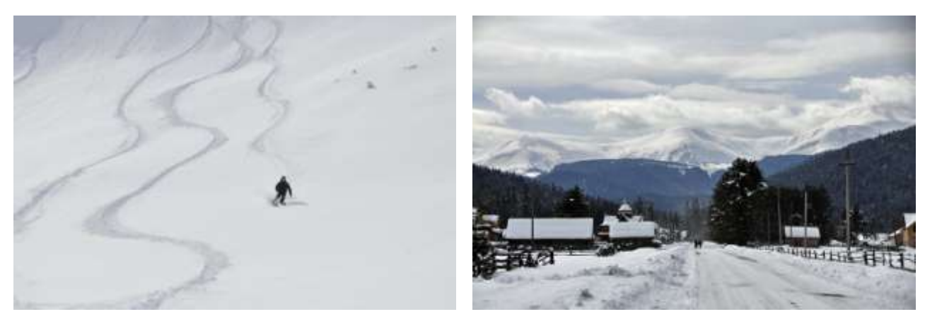
Downhill in Hoverla region

Day 7 Transfer to Lviv (240km, 6 hs). City visit, sightseeing. During the transfer, visit Ivano Frankivsk, Galitsh, Rogatin monuments (extra for city guides).