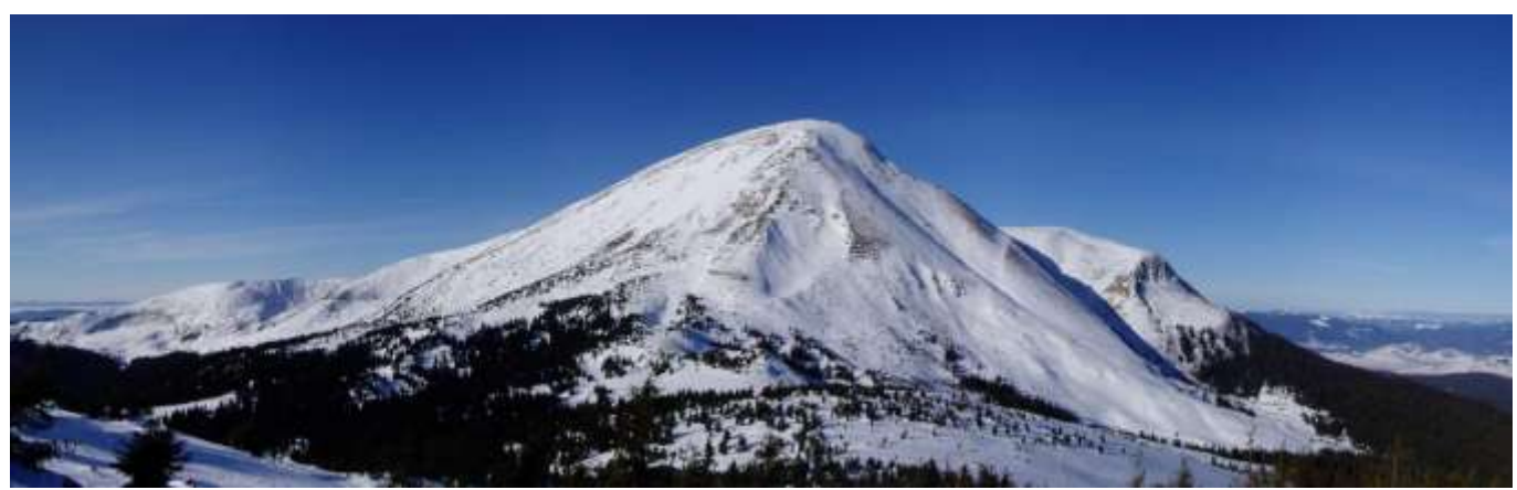
Petros peak 2020m

Day 6 Transfer to Kozmenchik 900m (30km, 1h). Ski tour to Petros peak 2020m, the 3rd point of the region and Ukraine. Descent to Kozmenchik, transfer to Tatariv.