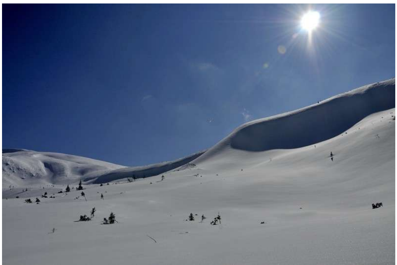
Turkul peak 1933 m

Day 3 Ski tour to Bliznitsa 1st peak 1881m. It is possible to use a ski lift 300m to start. Descent to Yasinya to the car road, 700m. Transfer to Tatariv village (40km, 1h) via Bukovel ski station. Hotel, double rooms.